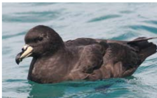
WESTLAND PETREL

The Westland petrel (taiko) is our very own seabird, which breed in the Paparoa foothills between Punakaiki and Barrytown, and nowhere else in the world. Fisheries bycatch is thought to be one of the major threats to their survival.