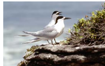
WHITE FRONTED TERNS

Patron, conservationist and photographer